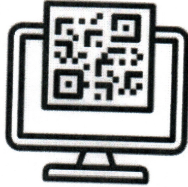
using a webcam