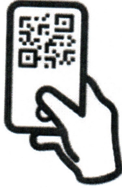
using a smartphone